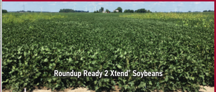
Roundup Ready 2 Xtend® Soybeans

Liberty® 280 SL Herbicide + Anthem® MAXX Herbicide + Amisol® Herbicide